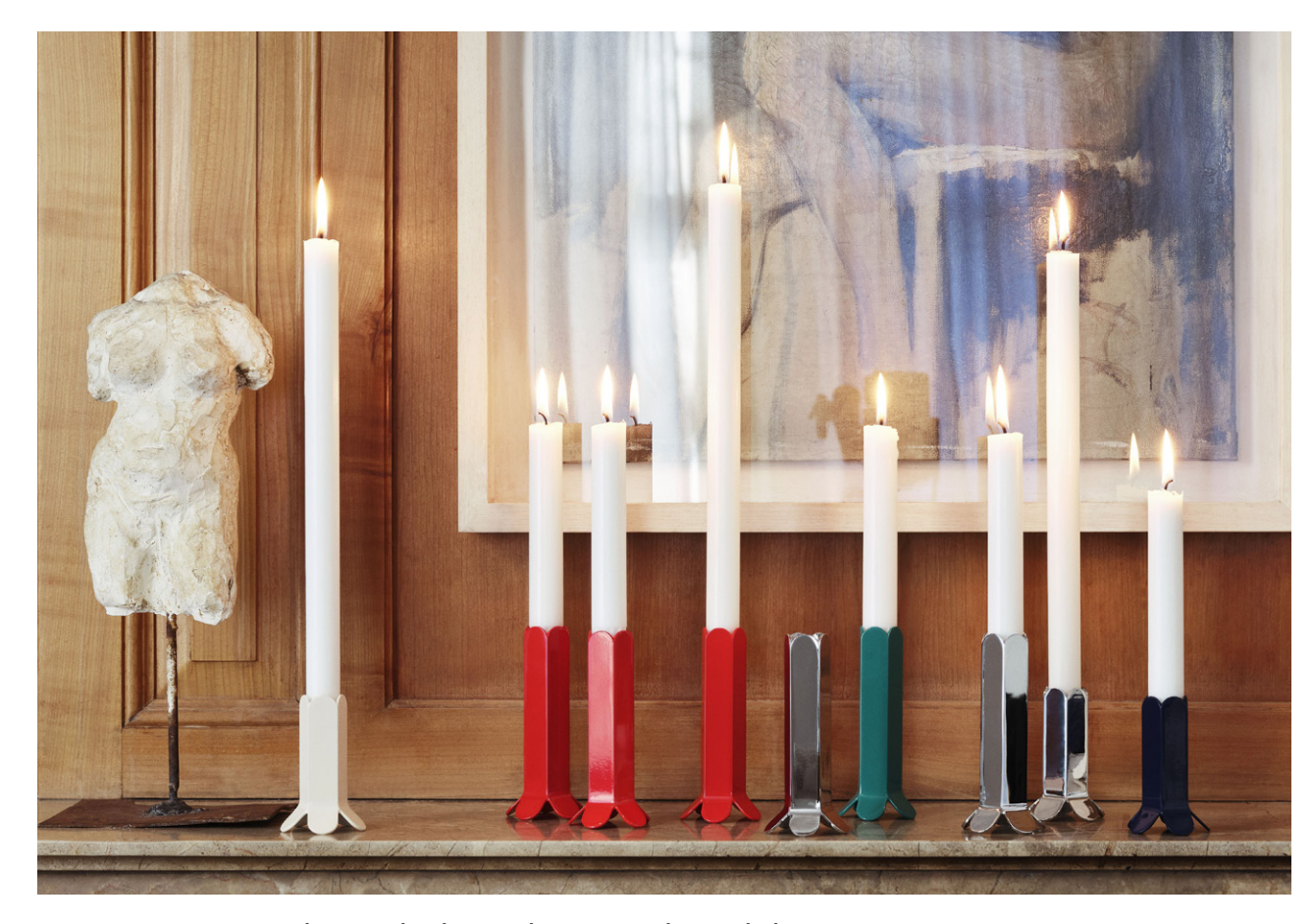
Mix and match the colours and models to create unique compositions.