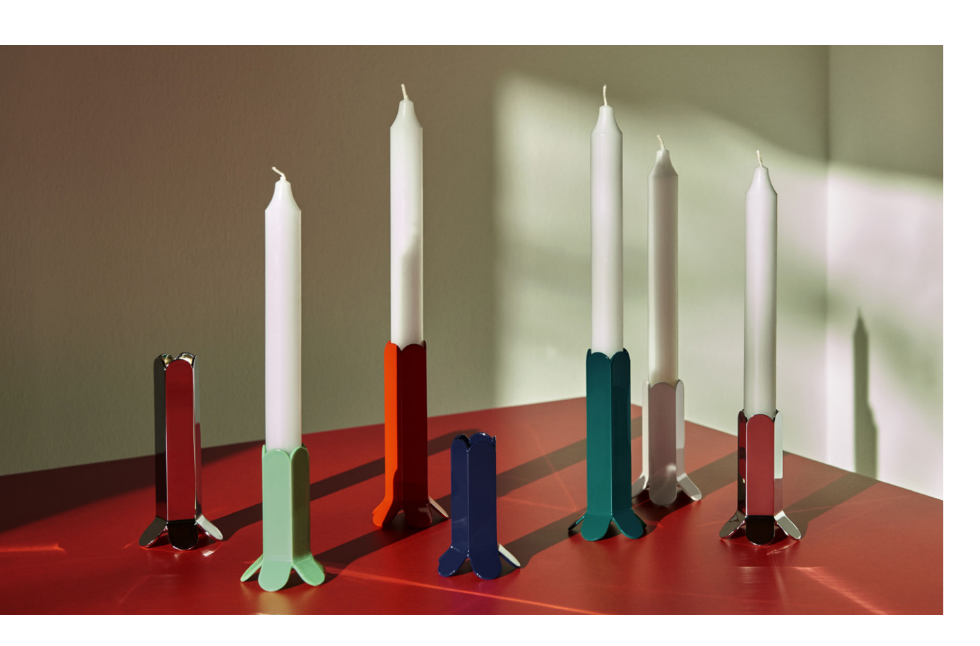
Arcs Candleholder is crafted in zinc alloy, and comes in two different heights with various colour options that include pastel, bright and mirrored finishes.