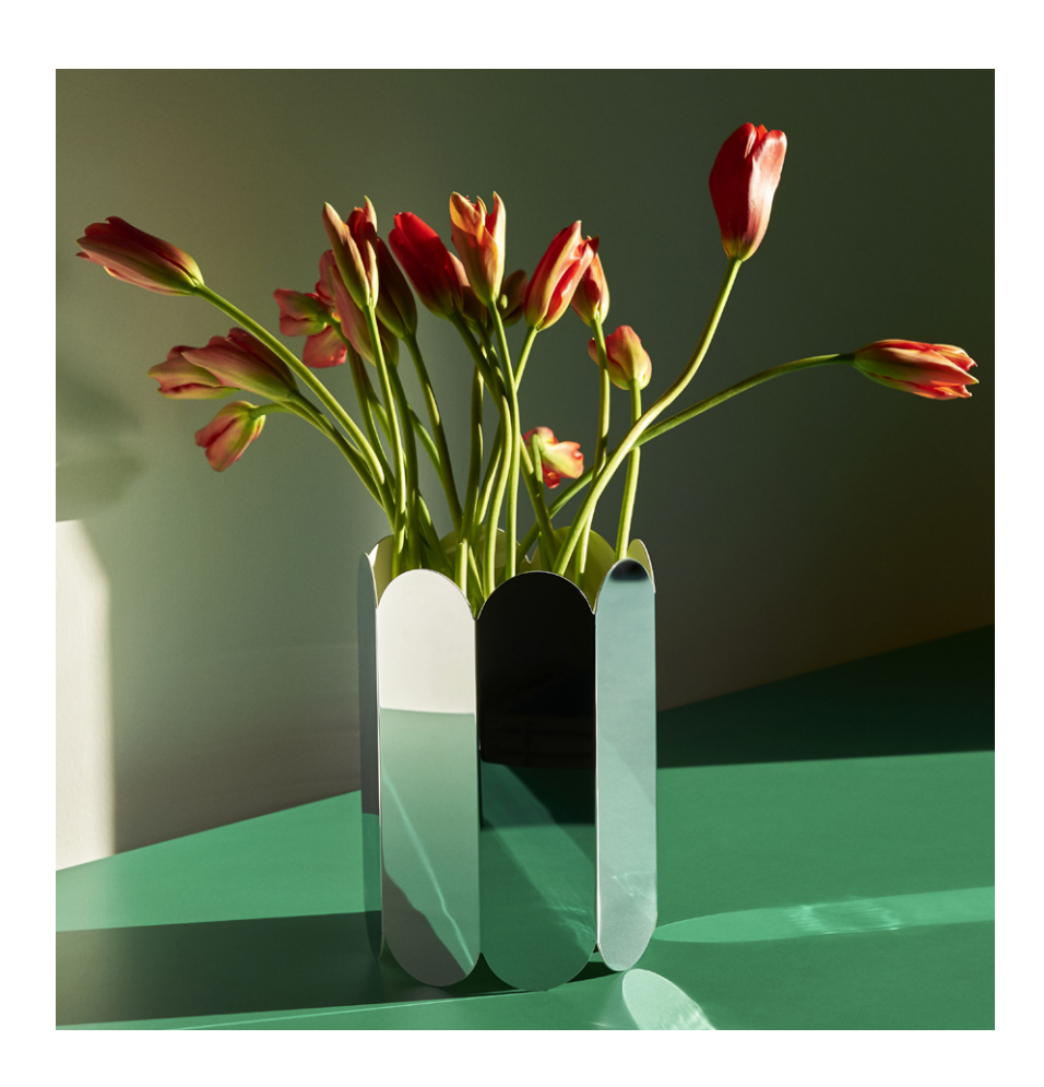
Made in stainless steel with a mirrored finish or steel in different colours.