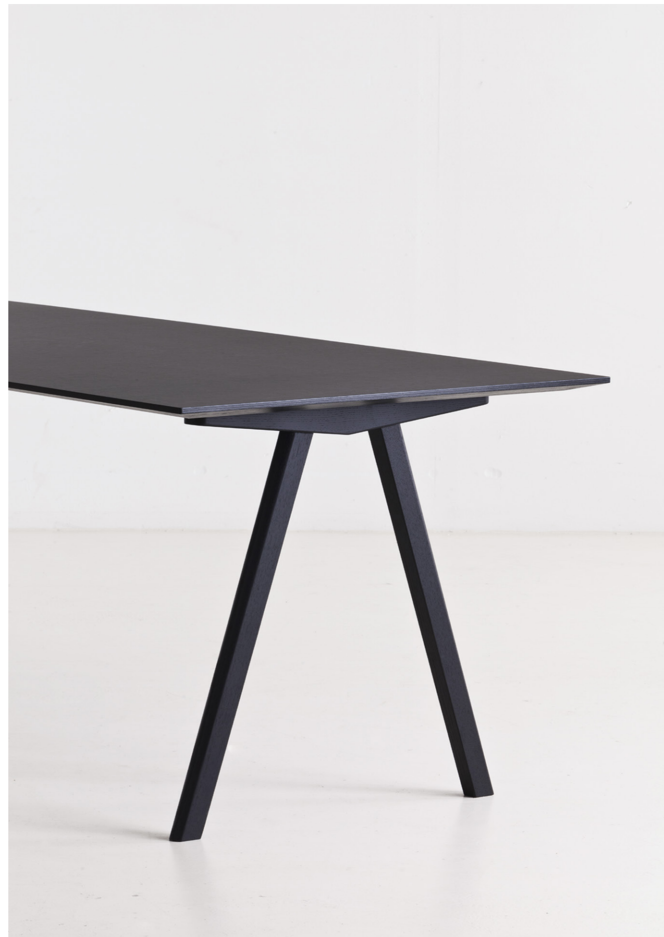
CPH 10 Desk | Black linoleum tabletop | Black oak frame

Featuring the same understated expression and focus on functionality as the rest of the series, the CPH10 has symmetrical legs with a more generous tabletop, creating a larger workspace and greater flexibility. Available with tabletops and frames in a variety of wood types, materials, and colours, with the possibility to select matching or contrasting combinations, it is suitable for using in a wide range of corporate and public contexts.