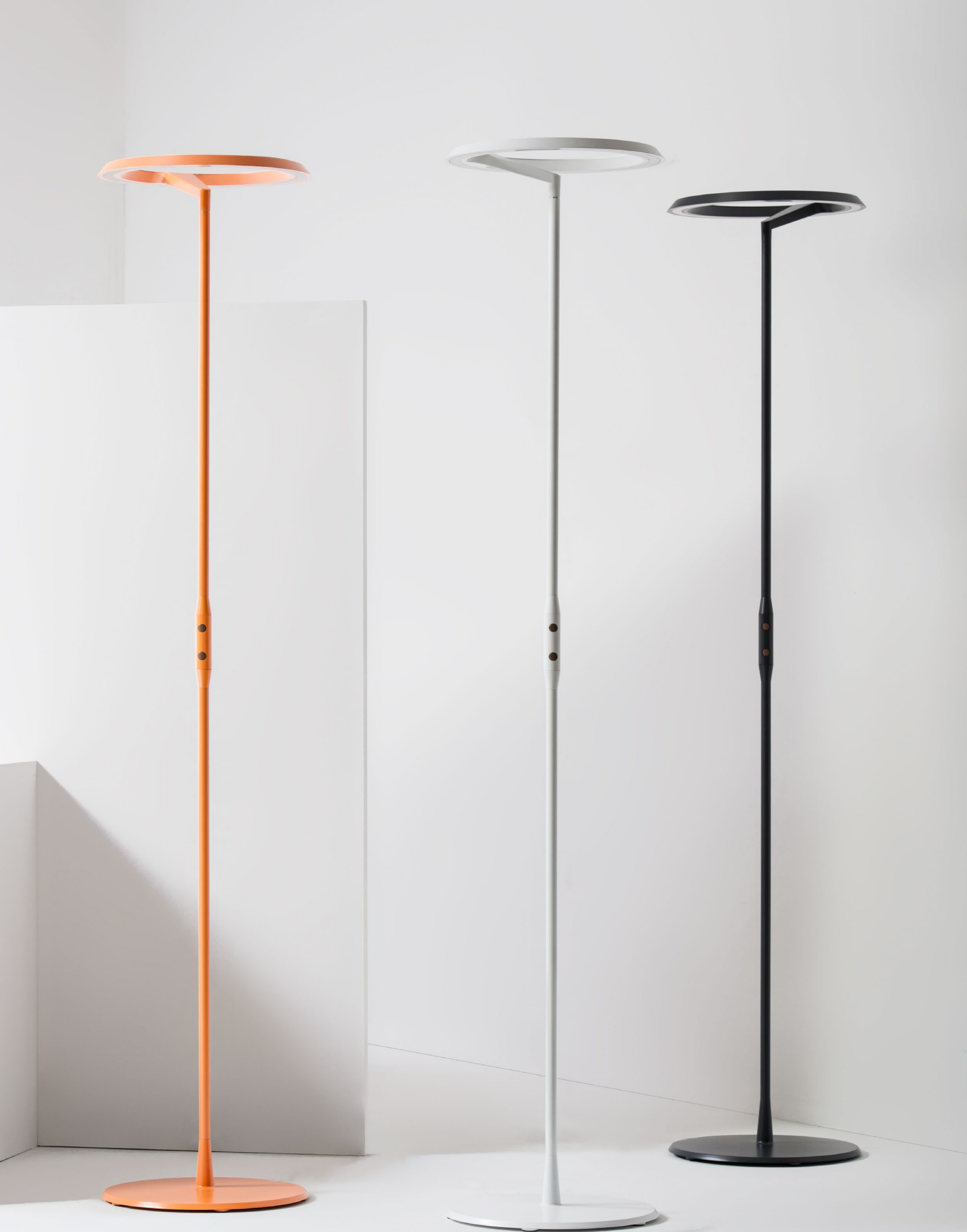
wästberg / w 126 claesson koivisto rune