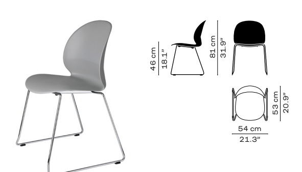
N02-20 GREY CHROMED STEEL BASE