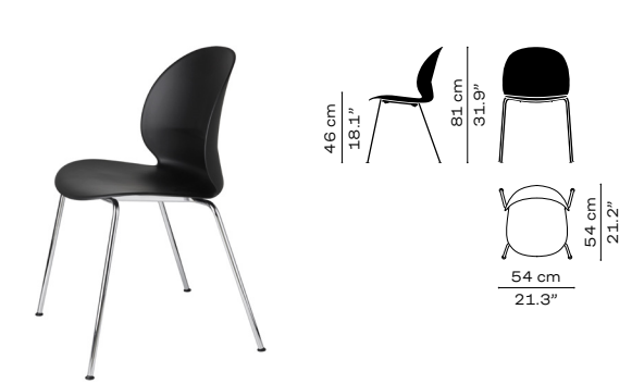
N02-10 BLACK CHROMED STEEL BASE

Please note that variations in colour may occur in recycled plastic.