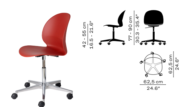
NO2-30 DARK RED POLISHED ALUMINIUM BASE, CASTORS W. BLACK PLASTIC HOUSING