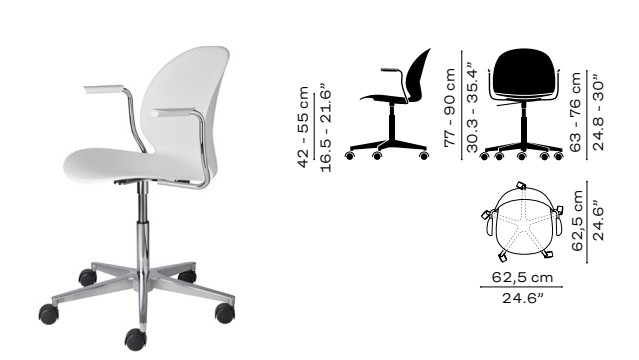
N02-31 OFF WHITE POLISHED ALUMINIUM BASE, CASTORS W. BLACK PLASTIC HOUSING