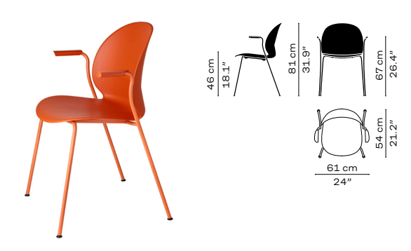
NO2-11 DARK ORANGE DARK ORANGE, POWDER COATED STEEL BASE